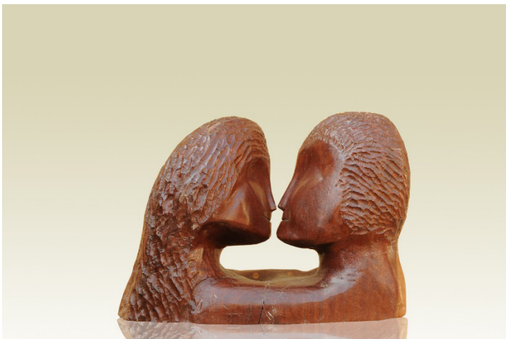
Figure 1. Haim Azuz. A Presence of Two (2010). Eucalyptus wood, 40×20×30 cm

Haim Azuz’s sculpture, A Presence of Two (2010) (Figure 1), would serve as a suitable example to discuss the definition of “amateurish” art that we would like to define as “modest” (on the axis between “amateurish” and “professional”). The theme of couple-hood, which the artist has elaborated in several sculptures over the years, is universal. There have been numerous sculptures dealing with this topic considered “high art” (Constantin Brâncuși’s The Kiss (1907), to mention only one). It is not its theme, which makes this art “amateurish”, nor is it the high skills of the sculptor treating the wood, but rather the style; the choice to create the man and the woman out of the same piece of wood, and the even composition of them facing each other, conveys the idea of couple-hood at first glance in a rather naïve way.